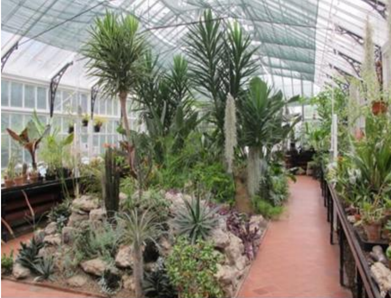
Gold, Broomfield Park Conservatory