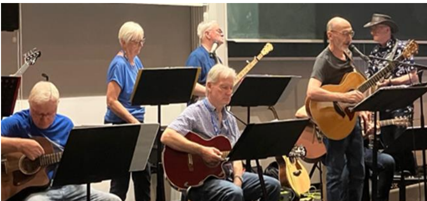
Litchfield u3a Guitar group