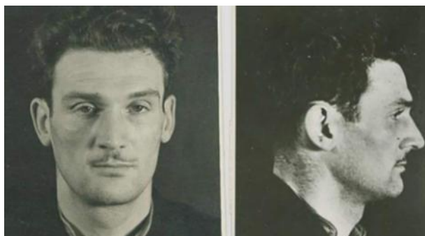
Chapman filed by MI5